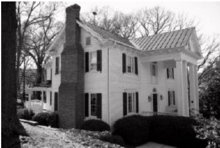
Below: Kilgore-Lewis House and the American Legion War Museum.