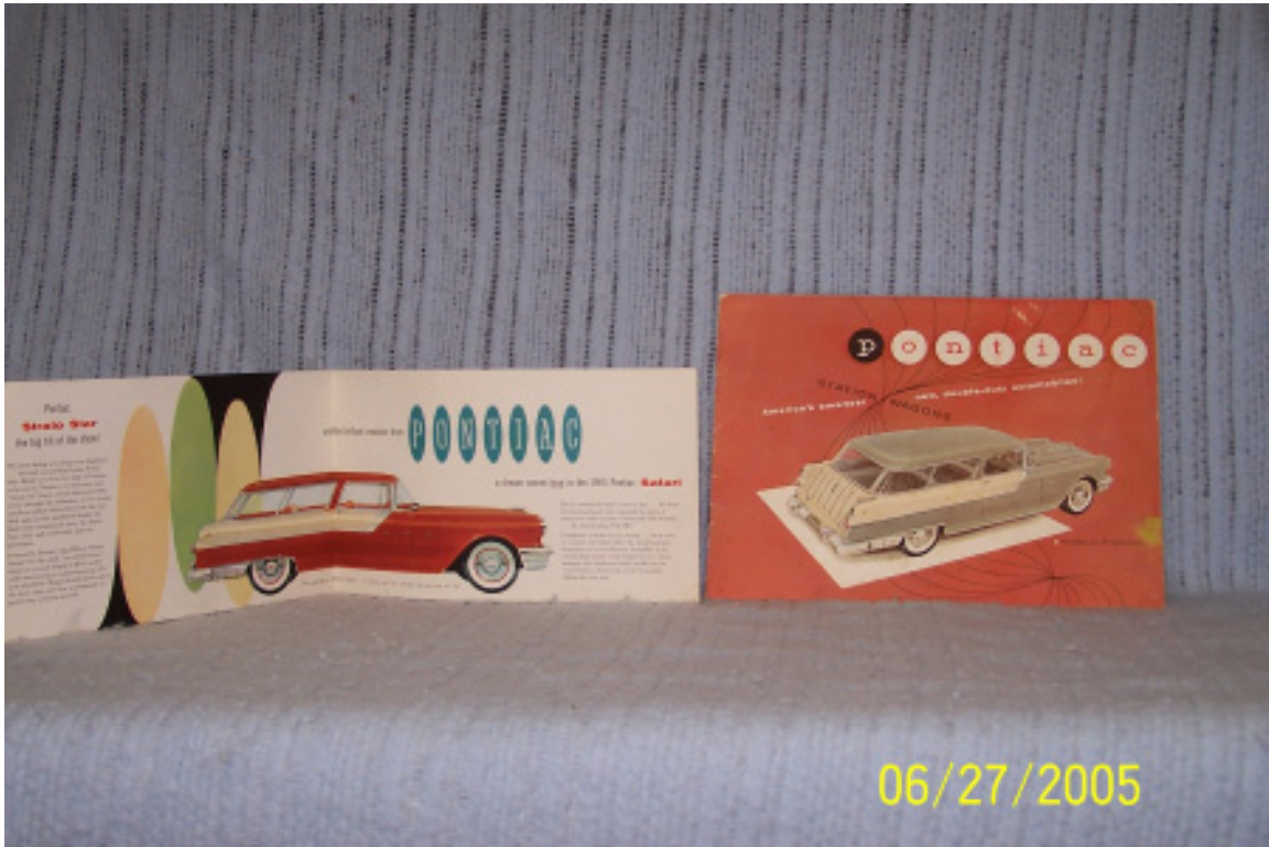
Above: 1955 Safari literature which is hard to come by since it was a mid-year car. Below: Pontiac matchbook covers, '55 seat cover samples and a '56 Facts Book.