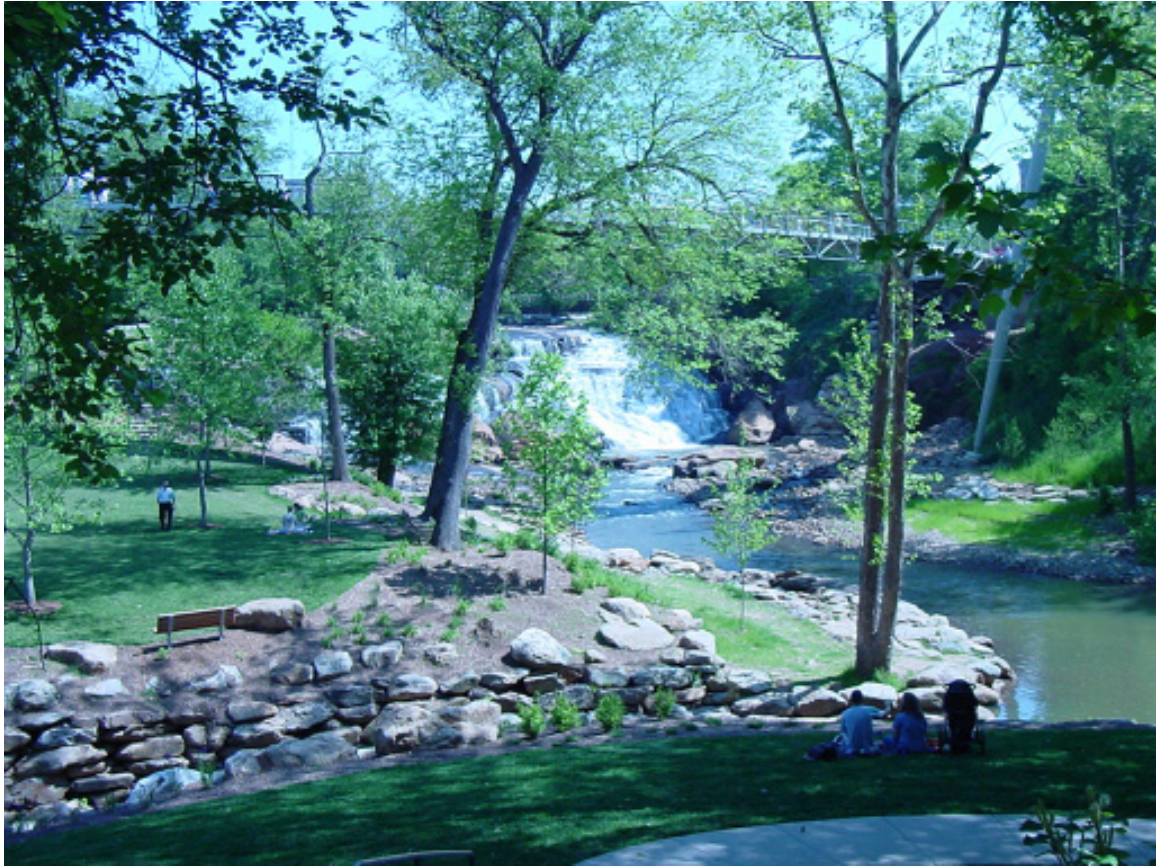
Above: Reedy River Falls Park in Greenville, SC.