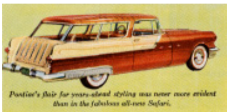
Pontiac's flair for years-ahead styling was never more evident than in the fabulous all-new Safari.

One last item of business, I haven't received any items to post in the Safari Search portion of the newsletter, (that's where people can post items/cars for sale or want ads), so I am not including that section in the newsletter until the need arises. There still are a couple of items for sale and want ads on the web site. Let me know if you have anything to update or add.