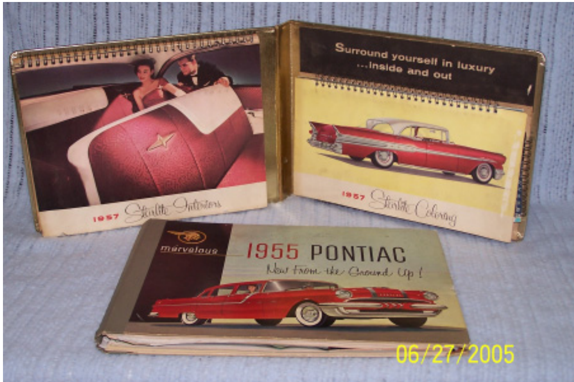
Above: 1955 and 1957 Pontiac Dealer Books, with interior and exterior options. Below: General Motors ad for the new '55 Safari and Nomad.